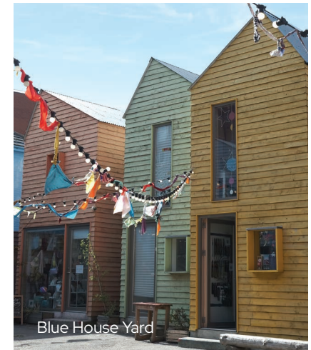
Blue House Yard