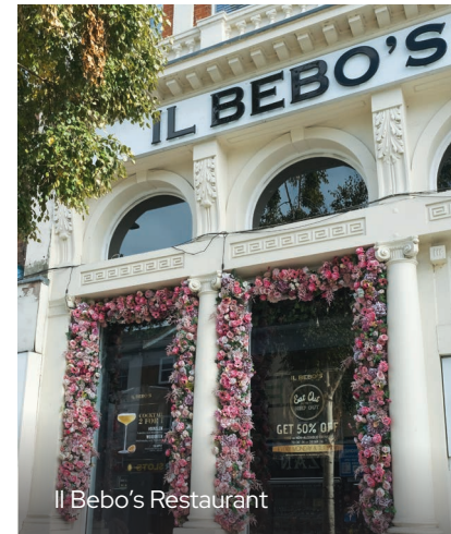
Il Bebo's Restaurant