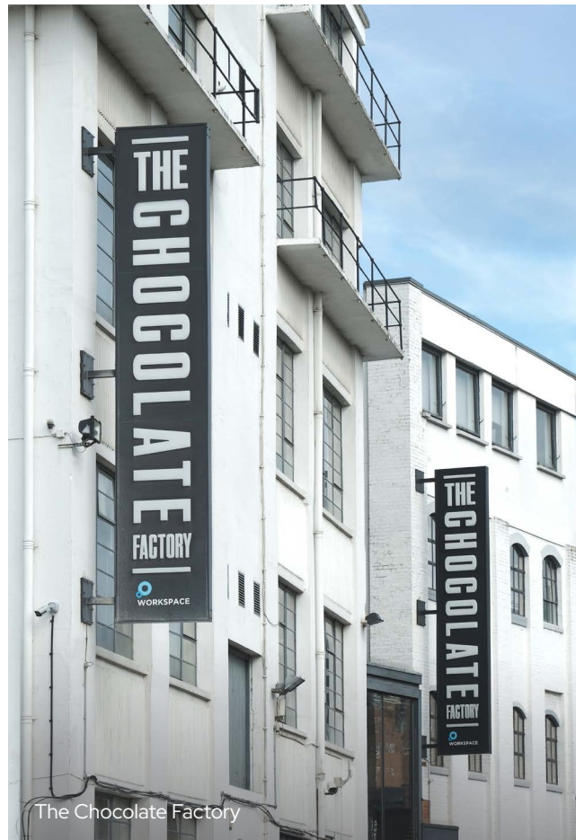
The Chocolate Factory

In a striking design that stitches seamlessly into the local area, Caxton Square stands on the corner of Mayes Road and Caxton Road just off the High Street and adjacent to one of the principal car parks. In 1880, Caxton Road was home to Barratts, who have grown to be one of the biggest confectionery manufacturers of the twentieth century, known for their fruit salad and blackjack sweets. The site is now The Chocolate Factory, a collection of offices and studios that bring employment opportunities into the locality. Wood Green is home to a variety of national and independent retail and leisure operators, all within easy reach of Caxton Square.